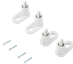
External attachment lugs 4-part set