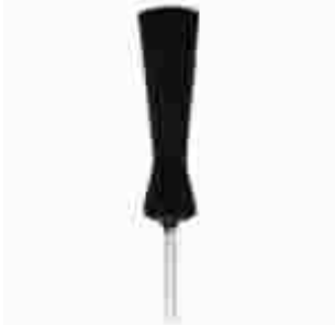
Tools for dismantling Weidmüller crimp contacts