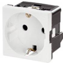
Power - sockets

FrontCom® Vario integrates multiple functions in only one single frame. The system is easy to install and you can select from a wide range of data, signal and power modules. In addition to being extremely compact, FrontCom® Vario offers a number of unique product features that will make your project planning and work activities secure, fast and future-proof. Furthermore, the FrontCom® Vario system has an attractive housing design that, by the way, offers highest impact-resistance and fully meets the requirements of IP 65 protection class.