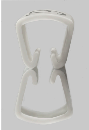
Similar to illustration