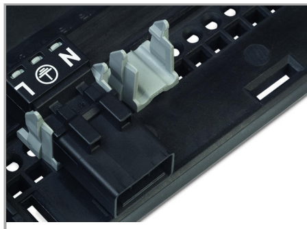
Adapter for WINSTA ® MINI and WINSTA ® MINI special connectors