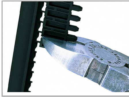
Remove unrequired areas from the sidewalls.