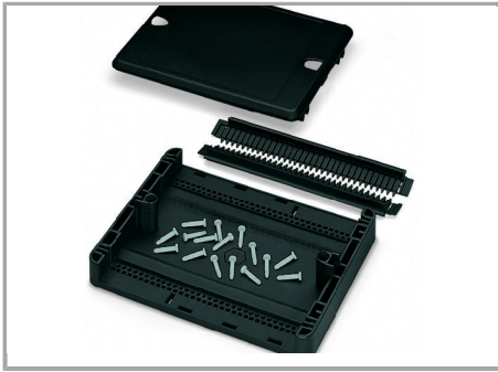
The set includes: 1 bottom, 1 lid, 2 sidewalls and 16 mounting pins.