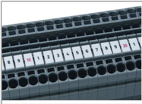
WMB "decade" marking