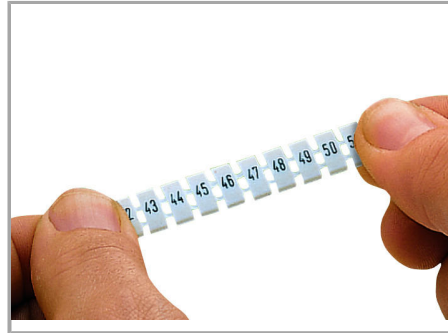
Stretching a WMB marker strip.