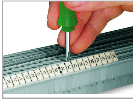
Snapping a marking strip into the marker slot.