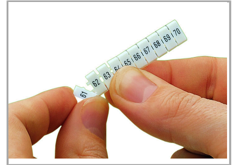
Separating an individual marker from the WMB marker strip – for larger terminal blocks.