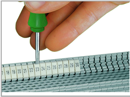
Snapping a WMB marker strip into the marker slot of the double marker carrier.