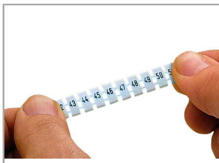
Stretching a WMB marker strip.