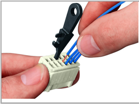
Conductor termination parallel to CAGE CLAMP® actuation