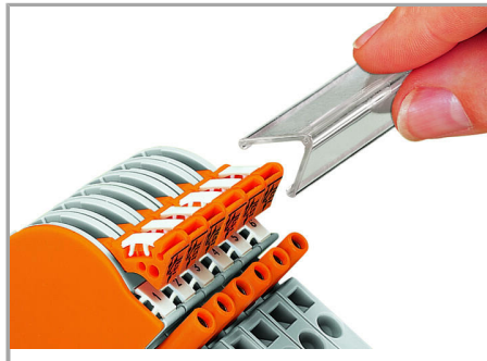
Snapping a transparent locking cover onto 1–8 disconnect links:

a) Mechanically lock several links for multi-pole switching applications