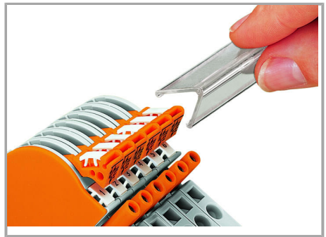
Snapping a transparent locking cover onto 1–8 disconnect links:

a) Mechanically lock several links for multipole switching applications