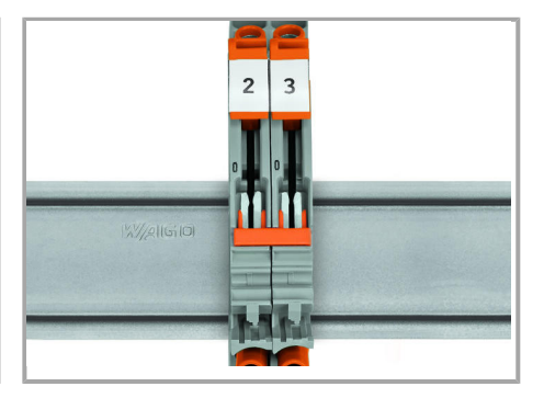
Insert insulated, touch-proof circuit jumpers into jumper slot.