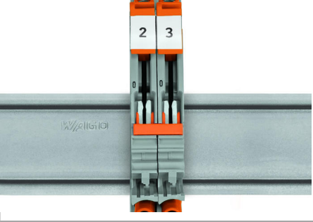
Insert insulated, touch-proof circuit jumpers into jumper slot.