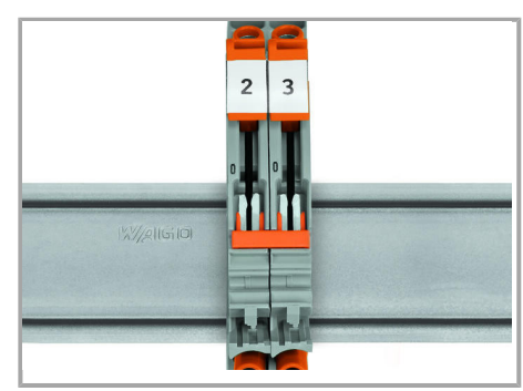
Preparing shorting path for the current transformer circuits.