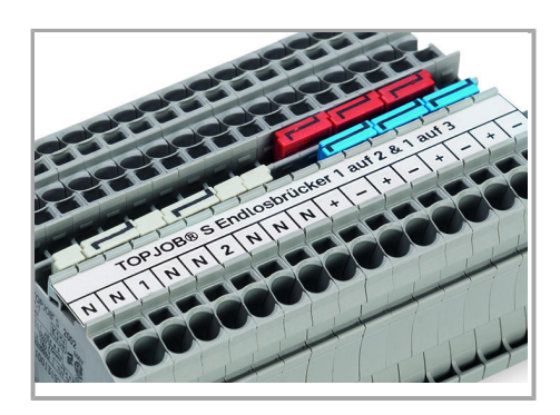
The 1-to-3 adjacent jumper for continuous commoning enables every other terminal block to be commoned. For example, positive and negative potentials can be accommodated alongside each other.