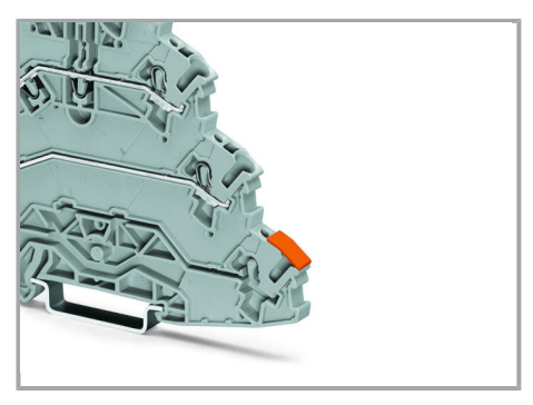
Creating spacer housings for electric motor wiring rail-mount terminal blocks via lockout caps (2002-192) for conductor entry and operating slot.