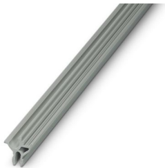
Holding profile, snaps into the cover holder APK-TU, with groove for Zack strip ZB 5 to ZB 10, length: 2 m

Please be informed that the data shown in this PDF document is generated from our online catalog. Please find the complete data in the user documentation. Our general terms of use for downloads are valid.