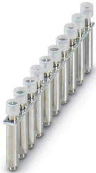
Screw bridge, with insulating collar, pitch: 8.2 mm, number of positions: 10, color: silver

Please be informed that the data shown in this PDF Document is generated from our Online Catalog. Please find the complete data in the user's documentation. Our General Terms of Use for Downloads are valid ( http://phoenixcontact.com/download )