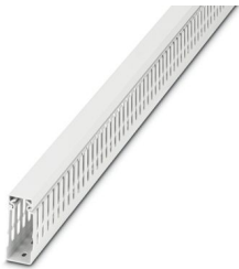
Cable duct for installation and mounting in control cabinets, white, comprising upper part and mounting base, width: 25 mm, height: 60 mm, length: 2000 mm

Please be informed that the data shown in this PDF document is generated from our online catalog. Please find the complete data in the user documentation. Our general terms of use for downloads are valid.