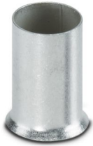
Ferrule, color: silver

Please be informed that the data shown in this PDF document is generated from our online catalog. Please find the complete data in the user documentation. Our general terms of use for downloads are valid.