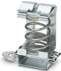
Shield connection terminal block, for applying the shield to busbars

Please be informed that the data shown in this PDF Document is generated from our Online Catalog. Please find the complete data in the user's documentation. Our General Terms of Use for Downloads are valid ( http://phoenixcontact.com/download )