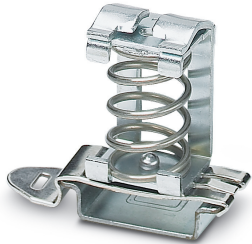
Shield connection terminal block, for applying the shield to busbars

Please be informed that the data shown in this PDF Document is generated from our Online Catalog. Please find the complete data in the user's documentation. Our General Terms of Use for Downloads are valid ( http://phoenixcontact.com/download )