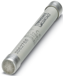
Fuse, 10.3 mm x 85 mm, up to 1500 V DC, gPV characteristic

Please be informed that the data shown in this PDF Document is generated from our Online Catalog. Please find the complete data in the user's documentation. Our General Terms of Use for Downloads are valid ( http://phoenixcontact.com/download )