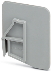
Partition plate, width: 2.2 mm

Please be informed that the data shown in this PDF Document is generated from our Online Catalog. Please find the complete data in the user's documentation. Our General Terms of Use for Downloads are valid ( http://phoenixcontact.com/download )