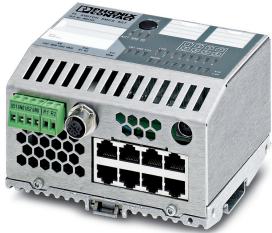
Ethernet Smart Managed Compact Switch with eight 10/100 Mbps RJ45 ports

Please be informed that the data shown in this PDF Document is generated from our Online Catalog. Please find the complete data in the user's documentation. Our General Terms of Use for Downloads are valid ( http://phoenixcontact.com/download )