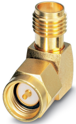
Antenna adapter, frequency range: 0.3 GHz ... 6 GHz, connection: SMA (female) -> SMA (male), angled 90°

Please be informed that the data shown in this PDF Document is generated from our Online Catalog. Please find the complete data in the user's documentation. Our General Terms of Use for Downloads are valid ( http://phoenixcontact.com/download )