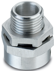
Breather, M20, for FB... enclosure

Please be informed that the data shown in this PDF Document is generated from our Online Catalog. Please find the complete data in the user's documentation. Our General Terms of Use for Downloads are valid ( http://phoenixcontact.com/download )