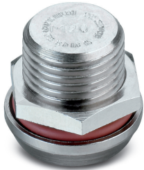
Plug, M20, for FB... enclosure

Please be informed that the data shown in this PDF Document is generated from our Online Catalog. Please find the complete data in the user's documentation. Our General Terms of Use for Downloads are valid ( http://phoenixcontact.com/download )