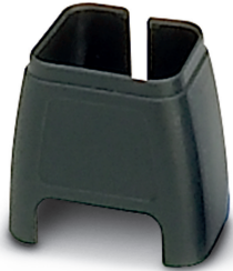
Color marking for patch cable, black

Please be informed that the data shown in this PDF Document is generated from our Online Catalog. Please find the complete data in the user's documentation. Our General Terms of Use for Downloads are valid ( http://phoenixcontact.com/download )