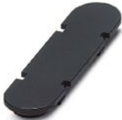
Cover for the 400 V mains connection of the Inline power-level terminals

Please be informed that the data shown in this PDF Document is generated from our Online Catalog. Please find the complete data in the user's documentation. Our General Terms of Use for Downloads are valid ( http://phoenixcontact.com/download )