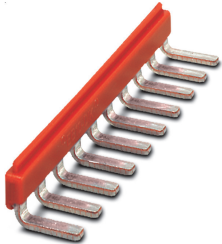
Insertion bridges, divisible, isolated comb spine, color red, 84-pos.

Please be informed that the data shown in this PDF Document is generated from our Online Catalog. Please find the complete data in the user's documentation. Our General Terms of Use for Downloads are valid ( http://phoenixcontact.com/download )