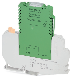
Bridging module, for bridging input and output circuit

Please be informed that the data shown in this PDF Document is generated from our Online Catalog. Please find the complete data in the user's documentation. Our General Terms of Use for Downloads are valid ( http://phoenixcontact.com/download )