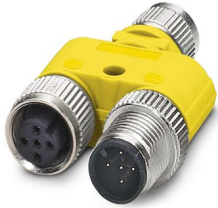
Emergency-stop Y plug

Please be informed that the data shown in this PDF document is generated from our online catalog. Please find the complete data in the user documentation. Our general terms of use for downloads are valid.