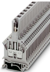
Component connector, pitch: 6 mm, number of positions: 1, color: gray, mounting type: Plug-in mounting

Please be informed that the data shown in this PDF document is generated from our online catalog. Please find the complete data in the user documentation. Our general terms of use for downloads are valid.