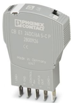
Electronic circuit breaker, 1-pos., active current limitation, status output and control input, plug for base element.

Please be informed that the data shown in this PDF document is generated from our online catalog. Please find the complete data in the user documentation. Our general terms of use for downloads are valid.