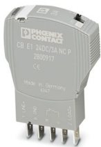
Electronic circuit breaker, 1-pos., active current limitation, 1 N/C contact, plug for base element.

Please be informed that the data shown in this PDF document is generated from our online catalog. Please find the complete data in the user documentation. Our general terms of use for downloads are valid.