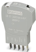
Electronic circuit breaker, 1-pos., active current limitation, status output and reset input, plug for base element.

Please be informed that the data shown in this PDF document is generated from our online catalog. Please find the complete data in the user documentation. Our general terms of use for downloads are valid.