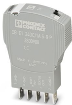
Electronic circuit breaker, 1-pos., active current limitation, status output and reset input, plug for base element.

Please be informed that the data shown in this PDF document is generated from our online catalog. Please find the complete data in the user documentation. Our general terms of use for downloads are valid.