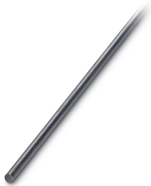
Return busbar, color: silver

Please be informed that the data shown in this PDF Document is generated from our Online Catalog. Please find the complete data in the user's documentation. Our General Terms of Use for Downloads are valid ( http://phoenixcontact.com/download )