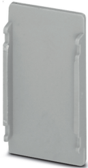
Separating plate, color: gray

Please be informed that the data shown in this PDF Document is generated from our Online Catalog. Please find the complete data in the user's documentation. Our General Terms of Use for Downloads are valid ( http://phoenixcontact.com/download )