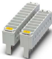
Coarse protection card cage CT, for holding 10 three-electrode gas-filled surge arresters, unequipped. Version: 10 double conductors

Please be informed that the data shown in this PDF document is generated from our online catalog. Please find the complete data in the user documentation. Our general terms of use for downloads are valid.