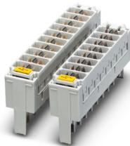
Coarse protection magazine CT, for holding 20 2-electrode gas-filled surge arresters of type H, bare. Version: 10 double conductors

Please be informed that the data shown in this PDF document is generated from our online catalog. Please find the complete data in the user documentation. Our general terms of use for downloads are valid.