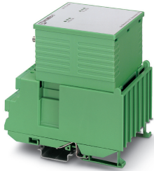
Replacement module electronics for IB ST (ZF) 24 BK-T

Please be informed that the data shown in this PDF Document is generated from our Online Catalog. Please find the complete data in the user's documentation. Our General Terms of Use for Downloads are valid ( http://phoenixcontact.com/download )