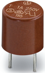
Replacement fuse, for INTERBUS-ST modules

Please be informed that the data shown in this PDF Document is generated from our Online Catalog. Please find the complete data in the user's documentation. Our General Terms of Use for Downloads are valid ( http://phoenixcontact.com/download )