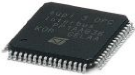
Slave protocol chip, for INTERBUS

Please be informed that the data shown in this PDF Document is generated from our Online Catalog. Please find the complete data in the user's documentation. Our General Terms of Use for Downloads are valid ( http://phoenixcontact.com/download )