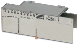
The figure shows version IBS RL 24 BK RB-LK-LK

Bus coupler with remote branch for INTERBUS; fiber optic technology with 2 Mbaud, rugged metal housing with IP67 protection, tool-free mounting on a separate mounting plate, can be used directly on welding robots