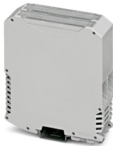
DIN rail housing, Complete housing with metal foot catch, tall design, with vents, width: 35.2 mm, height: 99 mm, depth: 113.65 mm, color: light grey (similar RAL 7035), cross connection: DIN rail connector (optional), number of positions cross connector: 5

Please be informed that the data shown in this PDF document is generated from our online catalog. Please find the complete data in the user documentation. Our general terms of use for downloads are valid.