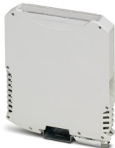
DIN rail housing, Complete housing with metal foot catch, tall design, with vents, width: 17.6 mm, height: 99 mm, depth: 113.65 mm, color: light grey (similar RAL 7035), cross connection: DIN rail connector (optional), number of positions cross connector: 5

Please be informed that the data shown in this PDF document is generated from our online catalog. Please find the complete data in the user documentation. Our general terms of use for downloads are valid.