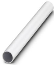
Tube, 1000 mm long, Ø 25 mm

Please be informed that the data shown in this PDF document is generated from our online catalog. Please find the complete data in the user documentation. Our general terms of use for downloads are valid.