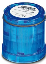
LED permanent light element, 24 V AC/DC, blue

Please be informed that the data shown in this PDF document is generated from our online catalog. Please find the complete data in the user documentation. Our general terms of use for downloads are valid.