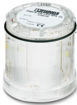
LED random flashing beacon element, 24 V DC, clear

Please be informed that the data shown in this PDF document is generated from our online catalog. Please find the complete data in the user documentation. Our general terms of use for downloads are valid.